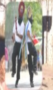
Los Matachines de Bernalillo